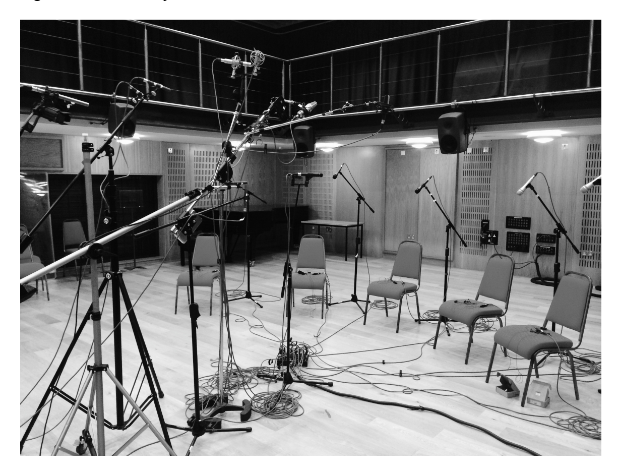
Figure 2: Initial microphone test.

emphasize and manipulate the acoustic disparities between the different nodes of a network. Andrew Hugill also identifies network space as a 'new frontier', which affords the opportunity to create virtual- and mixed-reality spaces (Hugill 2012: 81). Chris Chafe goes further, however, by exploring the idea of the network as a new kind of sound propagation medium, with its own distinct 'acoustic' properties (Chafe 2009).<sup>[7]</sup>