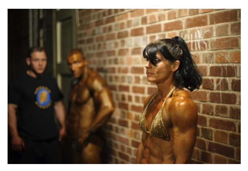
Figure 2 Routine 2010.

Her practice is likewise concerned with the building of a body, but rather than coming together from the assorted practices that have accidentally accrued, it is brought into being from the destruction and re-growth of muscle fibres and tissue. Her practice is not about arrival, it is not about the moment where her body meets the floor at the bottom of a staircase, rather it is a process of becoming. Her fall is extended, held in the continued stasis of an unfulfilled promise, or perhaps an impossible task worthy of Goat Island. And watching, holding this practice in my vision becomes equally impossible.