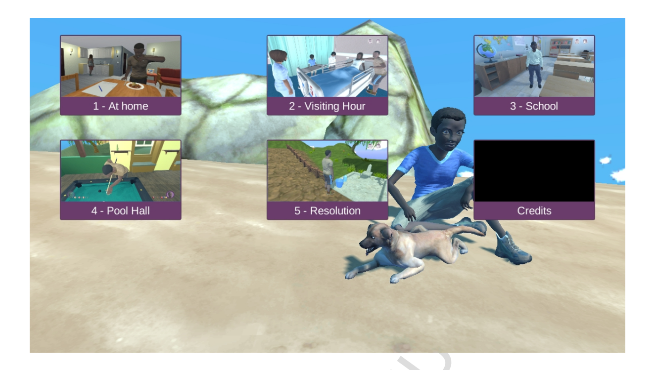
Figure 1. Screenshot showing the main character Jessie and 5 levels of the game.