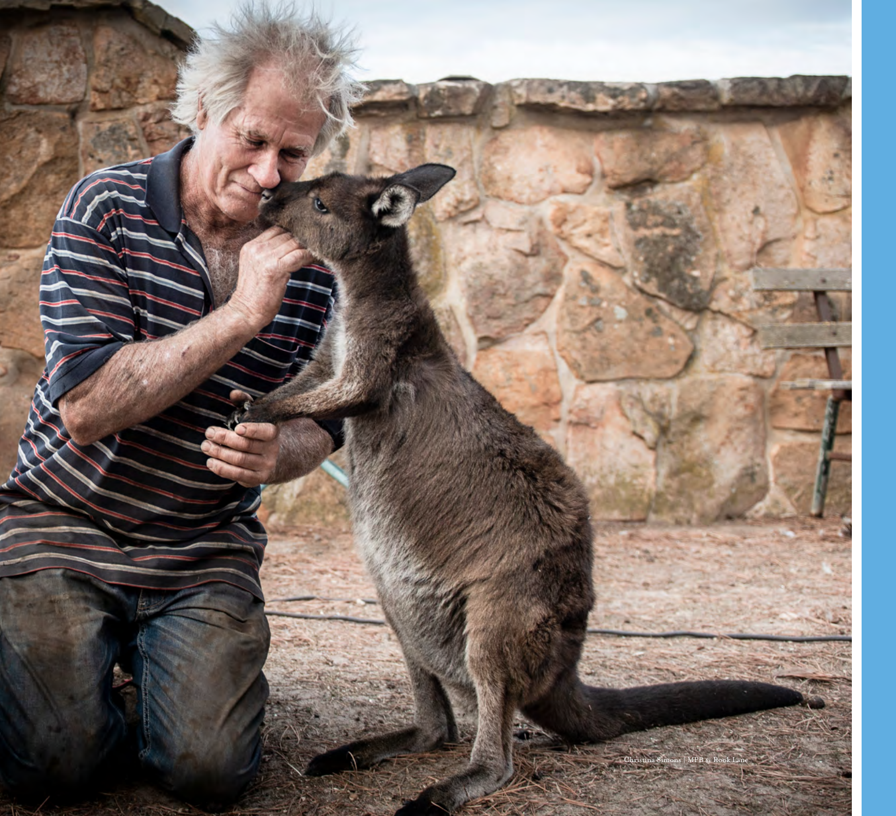
Photo | Frome is dedicated to showcasing and celebrating all levels of photographic endeavour from local, national, and international photographers.

The festival aims to put photography on the map in Frome and the Southwest of the UK – and, eventually, put Frome firmly on the international photo circuit.