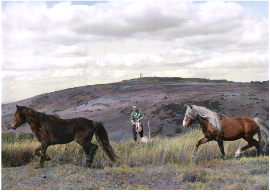
Leah Gordon | MPB @ Rook Lane

Based on last year's enthusiastic reception, Frome's unique late-night venue also becomes a photo gallery for the duration