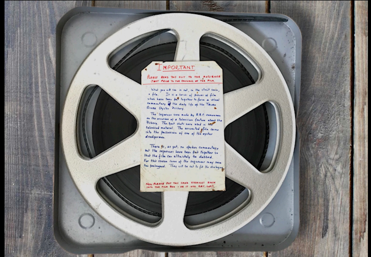
The original can of 16mm film, From the Culch , courtesy Seamonster Media.