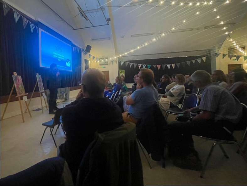
Director's Q&A at the Porthtowan Ocean Film Festival

Promo in the Porthtowan Ocean Film Festival programme