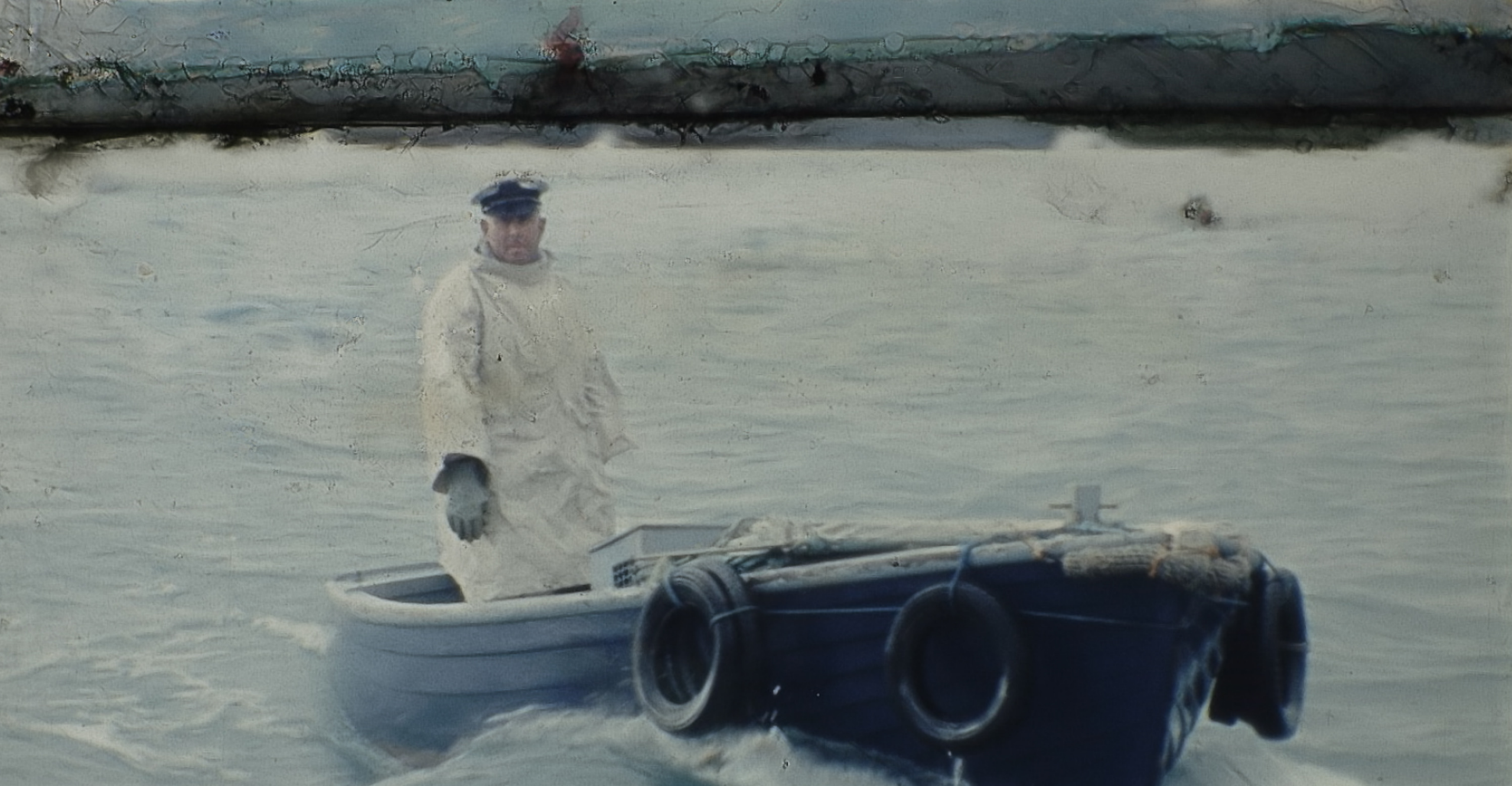
From the Culch (Paul Mulraney, 2023)