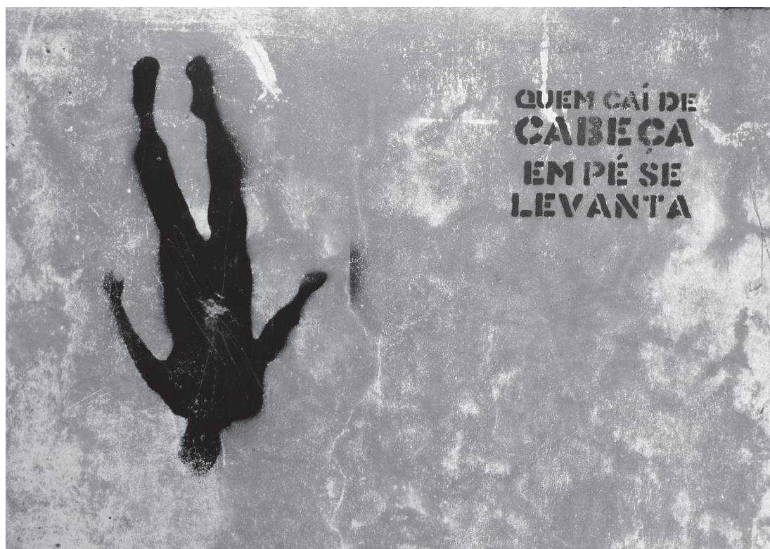
■ Who Falls Head-First Rises Upright , Street Art, Alameda, Lisbon. March 2013

The wealth of different falling perspectives in this issue is impressive and the writings affect us with a kind of wonder and awe about the theme of falling. These writings emphasize being in our bodies, in relation to the environment, in the actuality of falling, where we come face to face with uncertainty and the loss of empirical self and linear time. Not as a negative nihilistic experience – but rather as a pathway to curiosity - falling to fly.