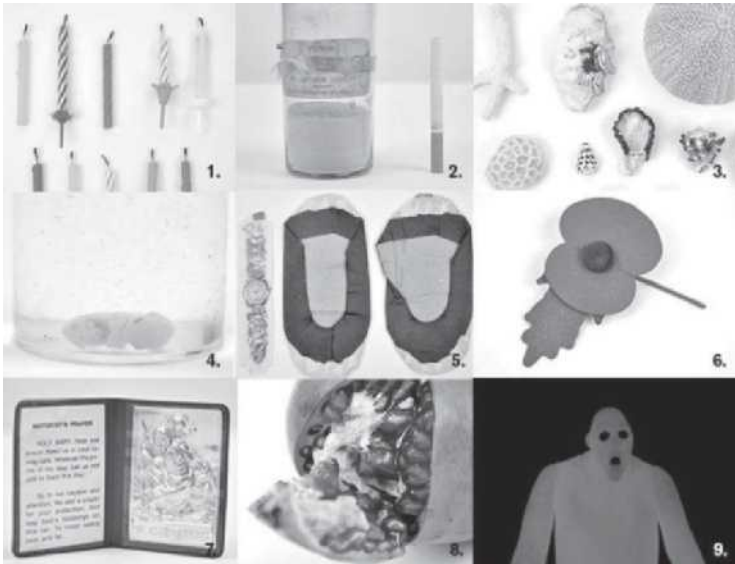
Fig. 14-1 Cabinet of Curiosity: Metaphors of Death