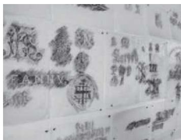
Fig. 14-3 Undead Type Workshop