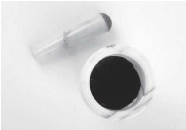
Fig. 14-10 Encompassed Death Complimenting Life