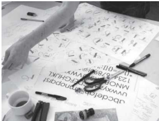
Fig. 14-6 Undead Type Workshop