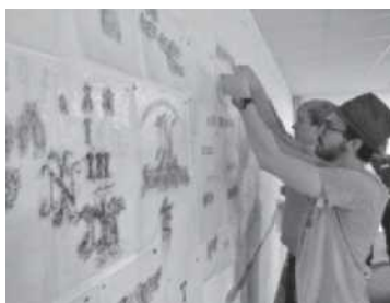
Fig. 14-4 Undead Type Workshop