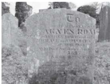
Fig. 14-2 Monumental Stone Cornwall

Her end was peace...in loving memory of...beloved wife of...also of his wife...beloved and only son...who fell asleep...gone but not forgotten...who departed this life...in affectionate remembrance of...peace perfect peace...the spot where she lay.