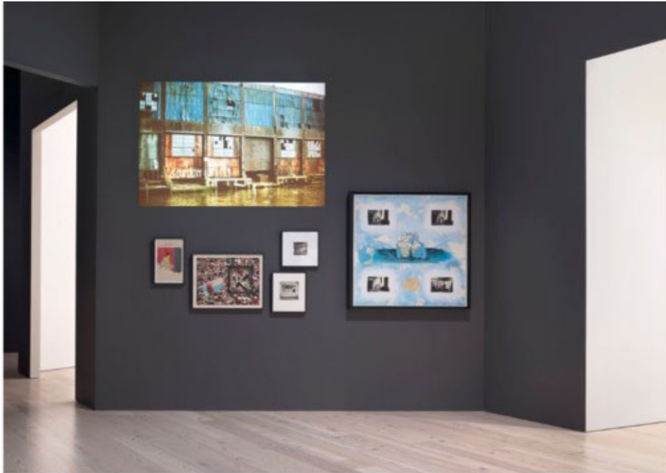
Installation view of David Wojnarowicz: History Keeps Me Awake at Night (Whitney Museum of American Art, New York, 13-19 September 2018). Clockwise from top left: Andrew Storer, Something Real

Installation view: Whitney Museum of American Art, New York, 2018 (below) and KW Institute for Contemporary Art, Berlin, 2019 (right)