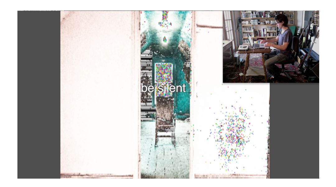
Figure 3: Studio performance of Kafka-Esque showing performer and system visuals

The development of typing systems was a response to the observation that the lyrics of songs are often difficult to follow in the live performance of popular music, particularly when the material is unfamiliar to an audience. Several aspects of a popular music performance compete for attention, such as vocal ability, instrumental ability, physical presence and the presence of system visuals. In Kafka-Esque (National Trevor 2014a), typing replaces singing. To reinforce this comparison, samples of sung syllables are triggered to match the sounds of the words being typed, and there is no delete function. Letters are projected to the audience as they are typed, putting the lyrics at the center of the performance (see Figure 3).