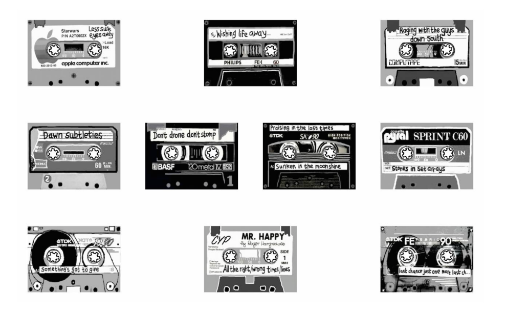
Figure 5: System visuals for Piece for Tape

As with Church Belles , the memetic agency of the system was significant. The selection of the cassette as the central metaphor influenced the inclusion of nostalgia and non-linear time as central lyrical themes. The system also demonstrates significant performative agency. The behavior and output of the loopers is unpredictable, which, coupled with the reflexive aspects of the system, facilitates improvisation during performance.