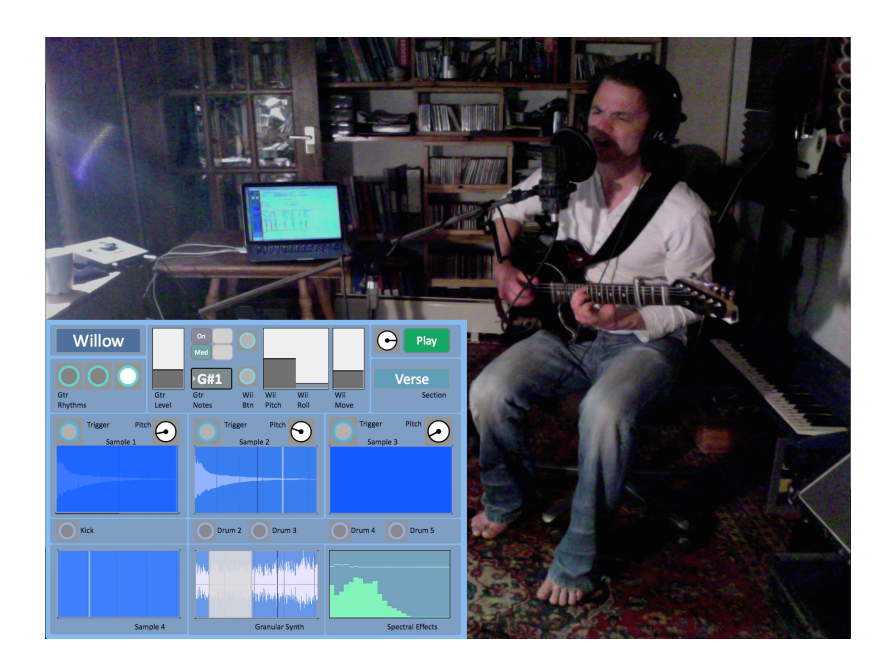
Figure 2: Studio performance of Willow showing performer and system visuals

While the system was successful in that it could reliably augment the human performance of a fairly traditional song, the system's agency was limited in terms of shaping the composition or performance. A further weakness was the system's visual output. The solution shown in Figure 2. is simply an abstracted version of the software itself, that functions primarily as a visual interface for the performer rather than significantly facilitating audience understanding of the system or contributing to the aesthetics of the piece.