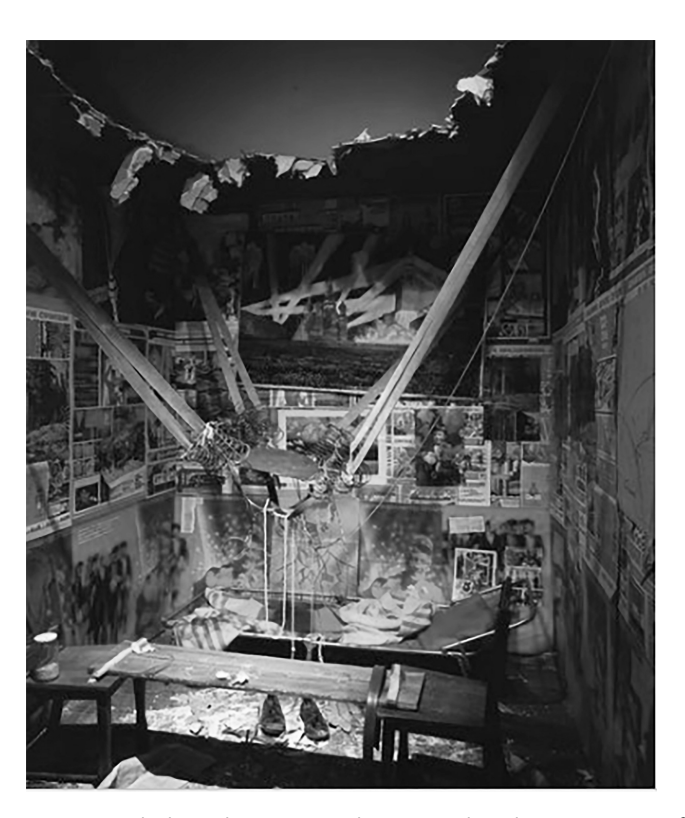
Fig. 20: Kabakov, Ilya, (1985) The Man Who Flew into Space from his Apartment. [installation].