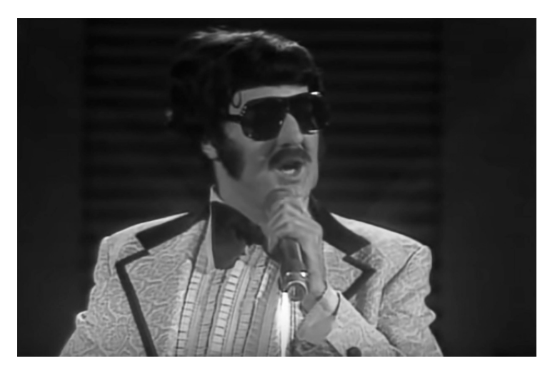
Fig. 15: Kaufman, Andy (unknown) Tony Clifton. (performance)

Auslander has considered Kaufman's work in the context of a representational system that is reinforced by the traditional framing of popular entertainment and its associated social norms and audience expectations (2000 and 2004). Kaufman's work blurs reality and fiction, disrupting that representational system. Auslander argues that this level of simulation and the interplay between reality and performance puts the presence and authority of the performer, as performer, at risk and therefore the viewer at risk. He theorized that Kaufman's project deconstructed presence, and, in so doing, discovered strategies of resistance within mass cultural contexts (2000:148). Kaufman's deconstruction of presence and authority as a performer, the undermining of representation, and the complicity of the viewer, introduce 'discontinuities' in the relations between viewer and artwork (ibid.). He seems to strain the relationship to its limits, to the extent where the audience becomes unsure whether to laugh, and unsure what is happening, and the strategy of putting a viewer at risk, could be understood in terms of a contract that is stretched to its limits, and even snaps. The performer and viewer fall out of a recognisable relationship and the viewer is no longer sure what kind of contract they are—or thought they were—a party to.