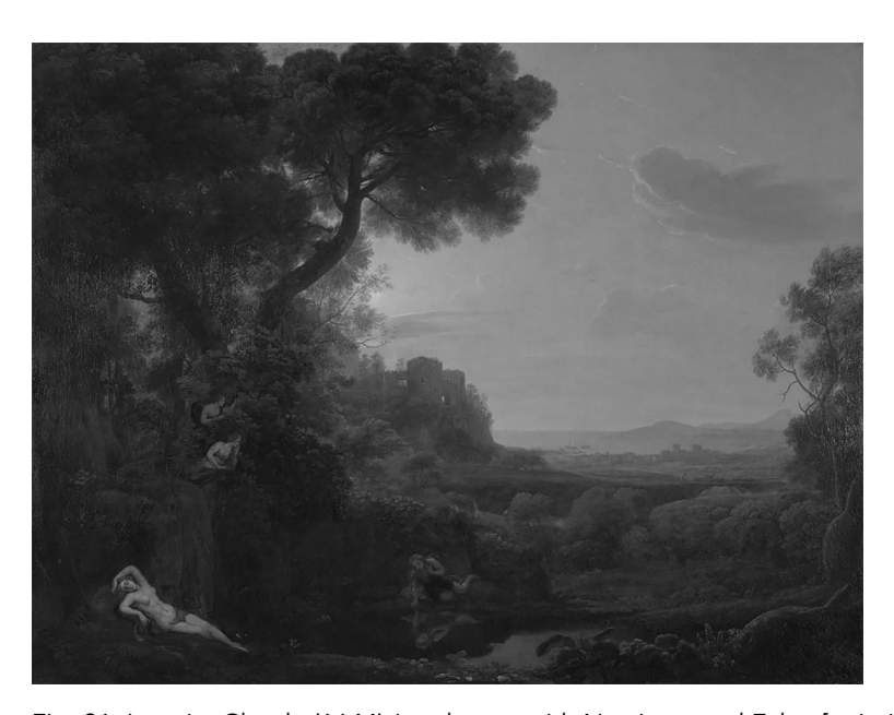
Fig. 21: Lorrain, Claude (1644) Landscape with Narcissus and Echo. [painting]

Pond introduces the live body into a relation with the landscape. Fine arts practices have a historical tradition concerned with the human figure in the landscape. The figure in the landscape sets up particular expectations that are different to where the body does not appear. Claude Lorrain was associated with the genre of history painting, where the landscape was the scene against which biblical and mythological narratives were represented by human figures, for example Landscape with Narcissus and Echo (1644) (see Figure 21). Pieter Brueghal The Elder was known for landscape and peasant scenes, where mythological narratives and parables were represented by the activities of the human figures, for example Landscape with the Fall of Icarus (1560) (see Figure 22).