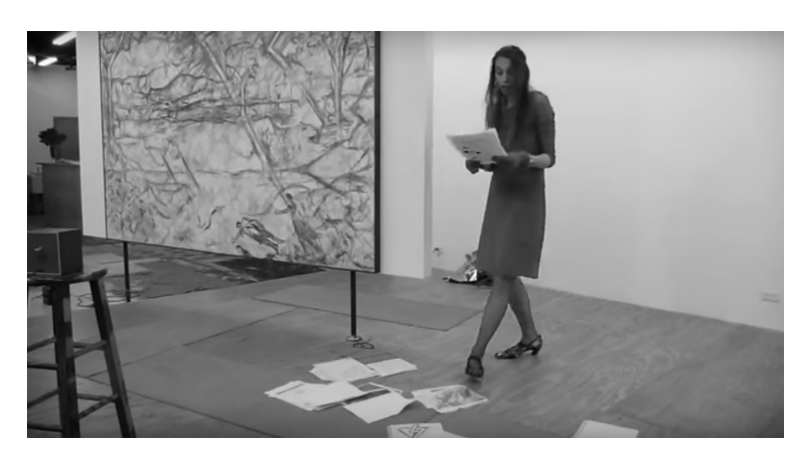
Fig. 28: Koether, Jütte (2009) The Staging of Restricted Means in the Landscape Redefines the Terms of Pleasure of Painting. [performance]

Parts of Kenny's description of Koether's work is set out in the following paragraph: