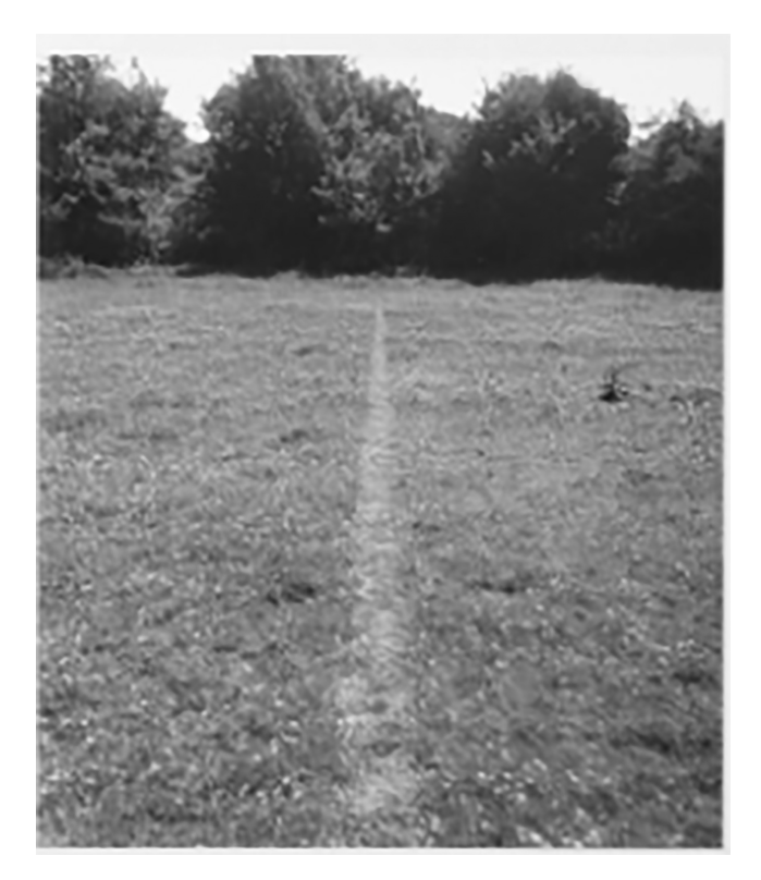
Fig. 26: Long, Richard (1967) A Line Made By Walking. [performance]

The figure of the artist Keith Arnatt is set up in a relation to the landscape in Self-Burial (Television Interference Project) (1969) (see Figure 27). The artist was interested in making works in the landscape that leave no trace behind, and in this work he 'hides' by burying himself in the earth. The work is series of photographs that were broadcast on German television, where one photograph was shown each day, for about two seconds interrupting the programming. The work is framed by the title, operating as a visual pun. When first shown, the work was 'neither announced or explained—viewers had to make what sense of them that they could' (Tate, 2018). Although Arnatt's work is now well known, at the time of first broadcast a viewer's attention is 'surprised' by Arnatt's intervention (Waldenfels, 2011:65).