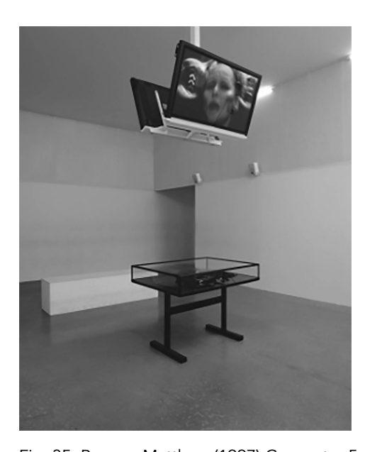
Fig. 35: Barney, Matthew (1997) Cremaster 5. [multimedia installation].

The signifying regime is turned to the world we inhabit 'as it is' (italics in original), however, the mythopoetic character, or the asignifying side of artistic practice, gestures beyond the limits of 'what is seeable/sayable' (O'Sullivan, 2011:203). Asignification takes on a political function in that it disrupts dominant systems of meaning, framing and representation where 'new and different myths' are produced 'for those who do not recognise themselves in the narratives and image clichés that surround them' (ibid.). The concept of mythopoeisis therefore gives rise to a tension and interaction between signification and asignification. This is reflected in How Soon , in terms of interactions between frames and layers, where frames initially allow the appearance of intelligibility, but break down, or dissolve, over duration becoming unintelligible in layers of attention.