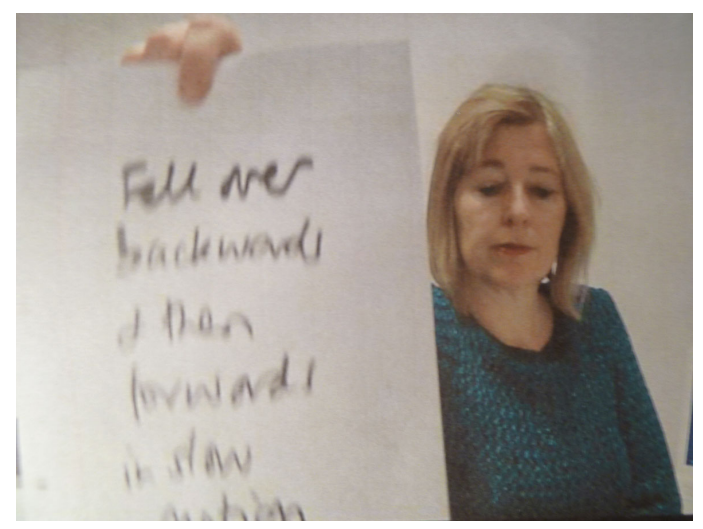
Fig. 2: Williams, Frances (2013) Confessions. [film still]

(This work is presented in Shift 2: Embarrassment and PD2: Embarrassment.)