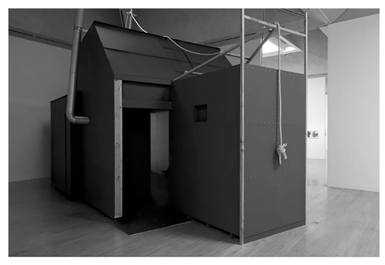
Fig. 10: Seers, Lindsay (2009) Extramission 6 (Black Maria). [Installation]

of waiting, and not knowing what to expect, changed the relationship between the work and myself, as a viewer.