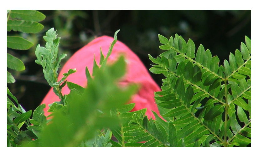
Fig. 7: Williams, Frances (2014) Pond Lifes. [film still]

(This Work is presented in Shift 2: Embarrassment and PD2: Embarrassment.)