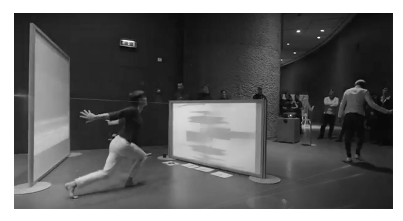
Fig. 30: Davies, Siobhan (2017) material/rearranged/to/be. [immersive performance]

Warburgs's ideas of the reoccurrence of gestures in different times, and the methods of rearranging the presentations. Different kinds of frames of attention and framings are invoked that also operate at the same time. On one hand, the works can be viewed through a particular established frame, but such a frame is continually subject to the effects of other frames, splitting from the main frame. Alternatively, the complications created are such that it could be said to effect a dissolution of frames altogether, so that the works, and the relations between viewer and artwork, can be said to be 'unframed', or to primarily reside in layers of attention.