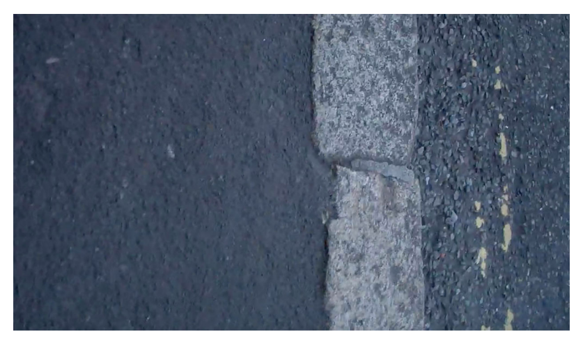
Fig. 4: Williams, Frances (2013) Mis-attentions. [film still]

(This Work is presented in Shift 1: Failure and PD1: Failure.)