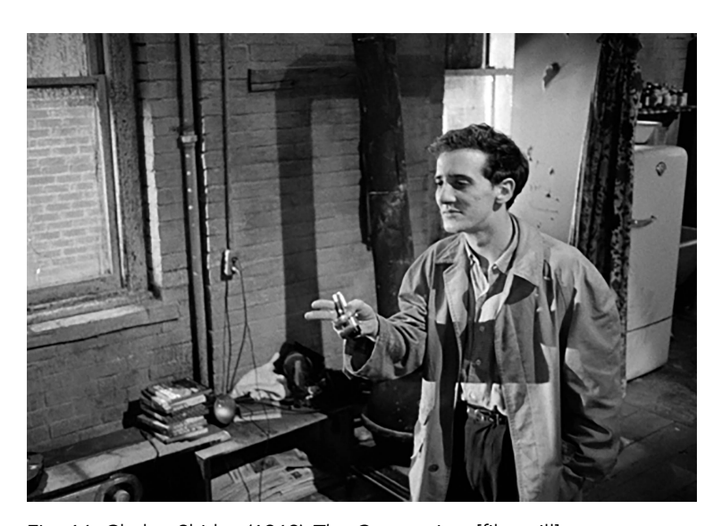
Fig. 16: Clarke, Shirley (1962) The Connection. [film still]

The disruption of representation is also suggested in Shirley Clarke's work The Connection (1962) (see Figure 16), based on a stage play by Jack Gelber. The work is framed as a documentary about a film crew, who are filming a group of jazz musicians who are apparently drug addicts. They play music, talk to the camera, take drugs and riff between each other and the crew, over the course of the work. The film is driven by an anticipated and discussed 'drugs connection' where the musicians' dealer makes his daily visit to their flat. The film is shot in one room. Its editing, direction, acting and writing, operate in such a way that the apparent documentary becomes difficult and uncomfortable to watch, as the narrative seems to falls apart, with the musicians both 'hamming' up to the camera, and being affected by the drugs, to the extent that one of the film crew becomes involved in injecting drugs himself.