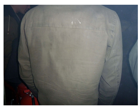
Fig. 3: Williams, Frances (2013) tempting failure. [photograph]

(This work is presented in Shift 1: Failure and PD1: Failure.)