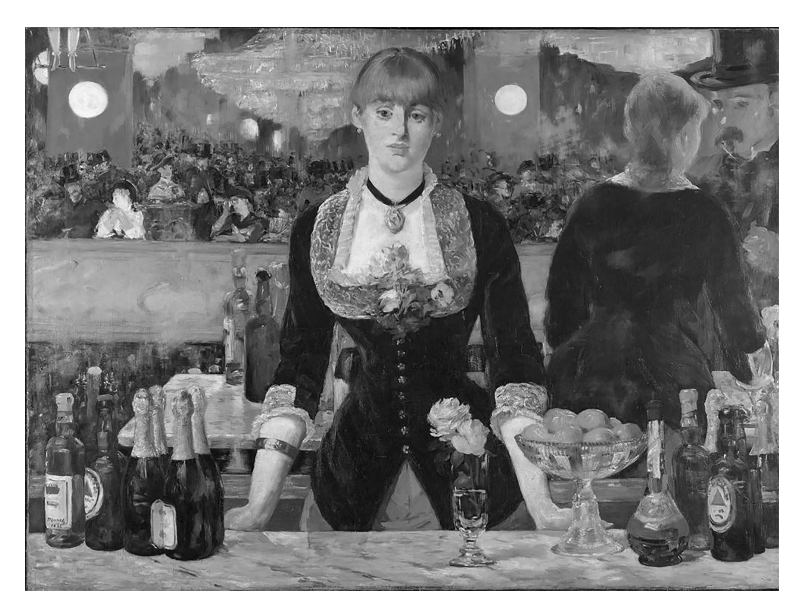
Fig. 18: Manet, Edouard (1882) A Bar at the Folies-Bergère. [painting].

The difficulty for a viewer in rationalizing an artwork that has no clear frame is described in Micheal Fried's account in Art and Objecthood of Tony Smith's description of a car ride, taken at night on the New Jersey Turnpike. Fried writes: