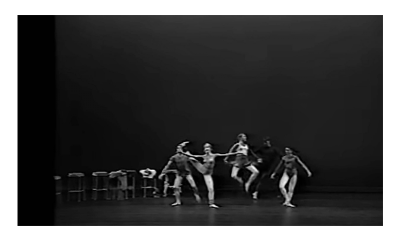
Fig. 31: Cunningham, Merce and John Cage (1983) Roaratorio. [performance]

industrialized countries. Against the vivid film images, are soundtracks that comprise Niblock's signature harmonic, 'drone' sound. The work is also performed live, with the musicians' positioned in front of multiple screens of these moving images (see Figure 32). The Movement of People Working can be thought of in terms of two sets of conditions that invoke two different kinds of frames of attention, that seemingly have nothing to do with each other, that is, the visual images and sound. These frames conflict with and contradict each other, and it becomes impossible to determine which particular frame (sound or vision) has dominance over the other as they blur together. It is proposed that this effect is a kind of 'trashing' of the frames where they 'bleed' together into layers of attention.