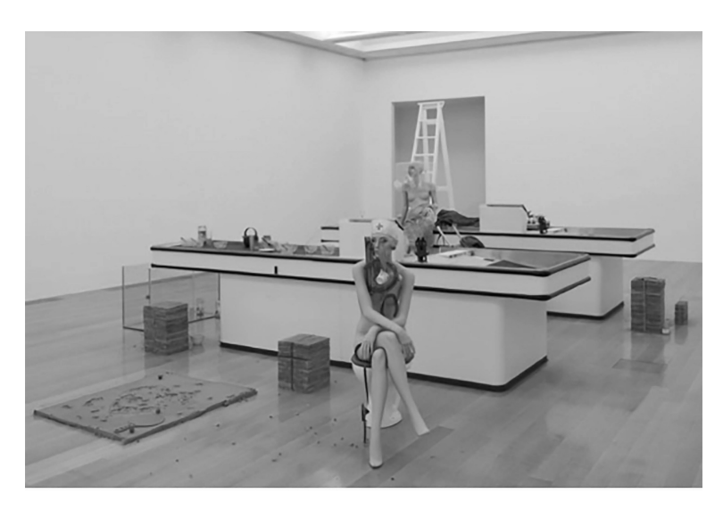
Fig. 34: Wilkes, Cathy (2008). I Give You All My Money. [installation].

An assemblage of different parts and pieces in a careful, and seemingly precarious construction that was somehow figurative and yet non-figurative at the same time [...]. Quite frankly I found this particular assemblage unfathomable, impossible to place. It seemed to stymie any interpretative strategies at my disposal (signifier enthusiast as I was myself back then). (O'Sullivan, 2011:190).