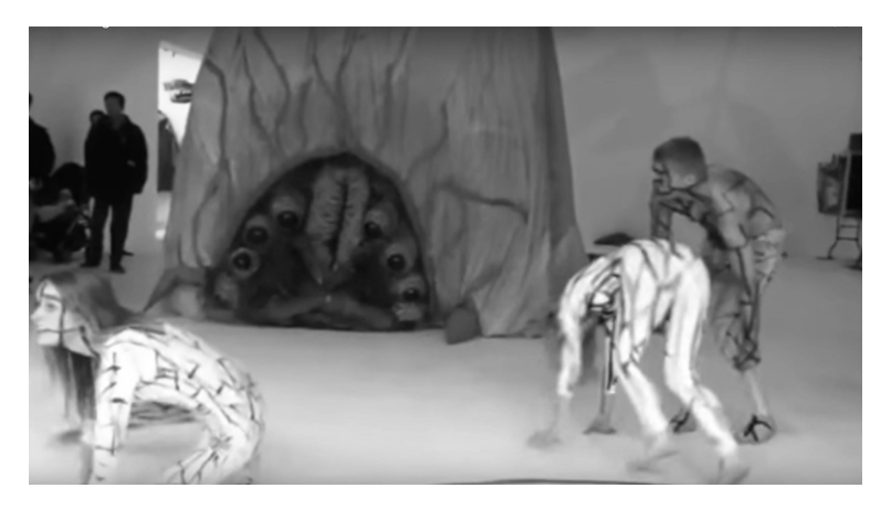
Fig. 33: Chetwynd, Marvin Gaye (2014) Brainbug. [performance]

Brainbug (2014) by Marvin Gaye Chetwynd, situated within the white cube gallery, is an example of how artistic practice 'plays' with the white cube frame (Chetwynd, 2014). This work was a performance that took place in a white cube gallery, comprising performers and dancers who interacted with and around a large, visceral puppet structure with sound (see Figure 33). The work took over an entire gallery area, and both over all and in terms of individual sculptural, costume, installation and performance aspects, it appeared to move between seeming very chaotic and improvisatory, to being carefully choreographed and managed. These aspects of the work could be said to reflect how attention is being managed or not, in the relations between viewer and artwork. It is argued that Chetwynd did not seek to critique the conditions of the white cube gallery in the work, but rather, seemed to embrace the conceptual and metaphorical complications by ignoring them, effectively 'trashing' the white cube frame and bringing multiple and heterogeneous 'other' kinds of attention to the foreground from layers.