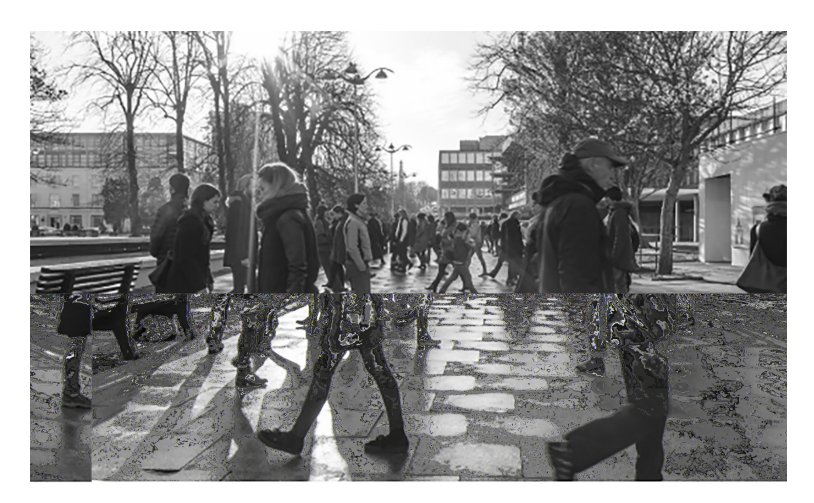
Fig. 25: Fulton, Hamish (2014) Walk On Plymouth. [performance]

and volunteers as performers to the experience of the works in the gallery. The practice seems to be held through the central frame of the figure of the artist in the landscape, surrounded and supported by multiple outer frames, formed by the accumulation of previous works, documentation and texts.