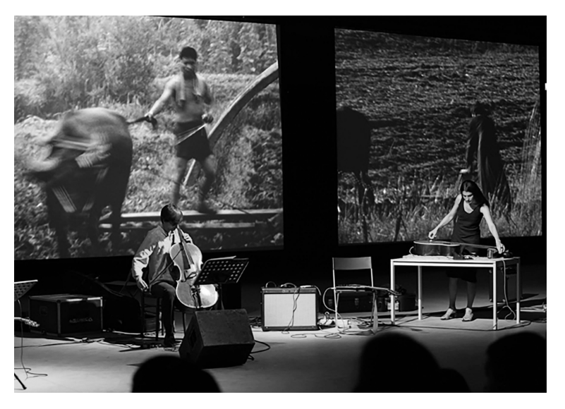
Fig. 32: Niblock, Phill (2003) The Movement of People Working. [performance]

A further consideration of Freeform is how it problematizes both the white cube frame and the theatre frame on their own terms. The work moves around the gallery continuously, and is not framed in the sense that the contextual or supporting aspects are ambiguous. As mentioned previously in relation to Freeform , there is little advertising and no artists' statement. There is no announcement signifying the start or the end of the work. The work becomes difficult to objectify in terms of the white cube frame, because it does not attempt to capture or sustain attention, in a one-to-one relation between viewer and artwork in an exchange of subjectivity. The work also becomes difficult to objectify in terms of the theatre frame, because there is no defined stage, no proscenium, and no formal, collective space for the viewer, and no timings. There is therefore no clear frame of attention within which the work is drawn to separate it from everything else.