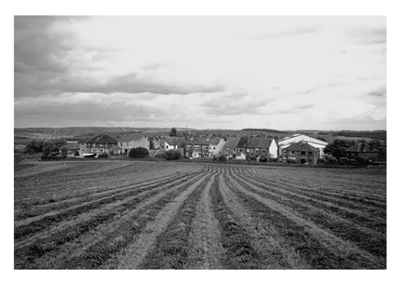
Fig. 24: Deller, Jeremy (2001). The Battle of Orgreave. [performance]

The landscape in Lorrain and Brueghal's work becomes the scene or background against which historical narratives unfold through their relation to the human figures in the paintings. In the works by Wildworks and Jeremy Deller, the landscape is also the background in which the narratives unfold through the activities and participation of performers as well as viewers in that landscape. The works can be considered in terms of parerga that frame the work. The conceptualization of the human figures, or live body, in the works and landscape are framed by the title and surrounding discourses that initiate the narrative. The landscape frames the live body and equally the live body frames the landscape. The relation between the human figure and landscape is intertwined.