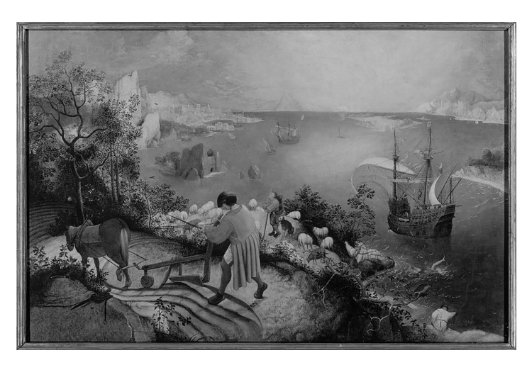
Fig. 22: Brueghal, Pieter The Elder (1560) Landscape with the Fall of Icarus. [painting]

The theatre group Wildworks, make immersive, site-specific works in the landscape with live figures. 100: The Day Our World Changed (2014) (see Figure 23) took place in The Lost Gardens of Heligan, Cornwall, to share memories and stories of Remembrance Day. The work was made with the participation of many community performers and viewers, in re-enactments of historical narratives. Jeremy Deller's The Battle of Orgreave (2001) took place in the original landscape in which the historical events had taken place in 1984, where they were re-enacted with the participation of historical re-enactors and former miners and police who had been involved in the original conflict. Figure 24 depicts the 'battlefield', before the performance took place. Both these works are also supported through surrounding documentation, texts, video, and discussions that further frame them.