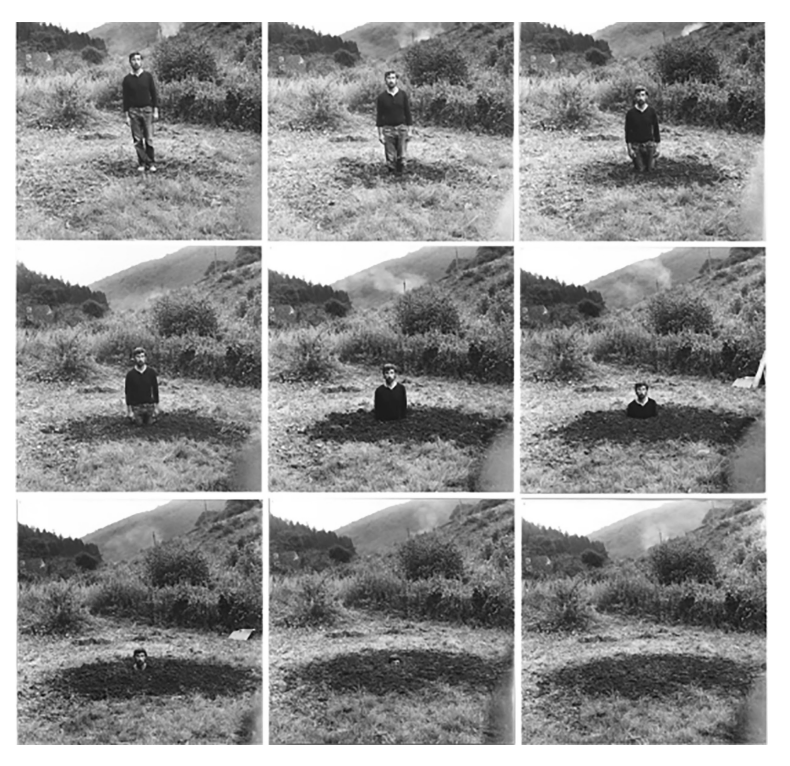
Fig. 27: Arnatt, Keith (1969) (Self-Burial (Television Interference Project) [sequence of photographs]

In summary, Pond and this aspect of the research underline the role of framing, representation and attention, in forming a stable relation between viewer and artwork through the live body as a frame of attention. It also considers how a lack of management of attention complicates those relations, creating potential displacements through self-consciousness, and the unpredictability of events that take place as a result. Pond also gave rise to ideas about how the live body may be hidden in the landscape, through representation, even where the live body is not present. The landscape, the live body and narrative, form inter-related frames of attention that depend on and support each other to provide a singular perspective. This aspect of the research also proposes different ways of hiding in the work, which produce both representational, and non-representational conceptualizations of the live body.