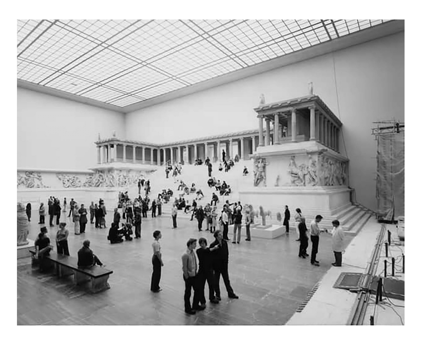
Fig. 11: Struth, Thomas (2001) Pergamon Museum 1. [photograph]

disrupted by the effects of the supplement, by extraneous events and entanglements, that are difficult to isolate from the viewer's relation to an individual artwork.