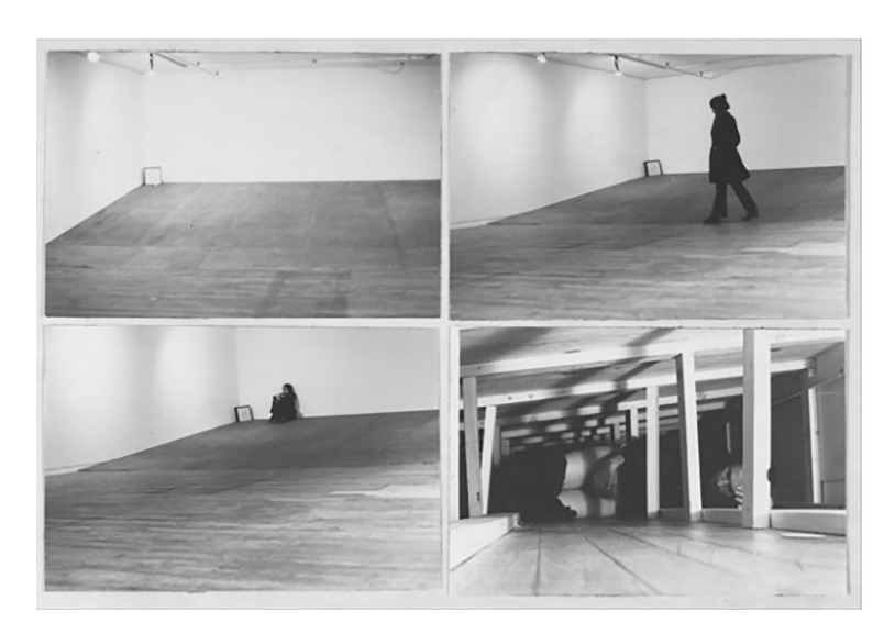
Fig. 19: Acconci, Vito (1972) Seedbed. [performance].

The method of hiding the performer could extend to work where the live figure is absent. In Ilya Kabakov's The Man Who Flew into Space from his Apartment (1985) (see Figure 20), the installation contains multiple signs, objects, and clues as to the unfolding narrative of the protagonist, who is absent. The work is separated from its surroundings through a structure that houses, and manages, its own attentional system. Kabakov refers to this kind of work as a 'total installation' where the viewer is an 'actor' and each element of the work is wholly intended towards their perception and the impression it will make (Bishop, 2005:14). Bishop uses Freud's approach to the interpretation of dreams (1997), as an analogy for how the viewer projects themselves 'into an immersive 'scene' that requires creative free-association in order to articulate its meaning' (Bishop, 2005:16).