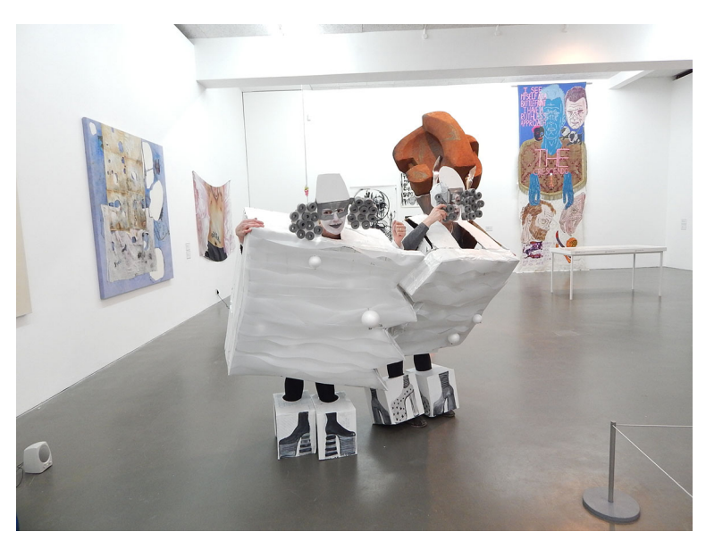
Fig. 8: Williams, Frances (2014) Fran's People: Freeform Interpretation. [photograph]

(This Work is presented in Shift 2: Embarrassment and PD2: Embarrassment and in Shift 3: Mis-attention and PD3: Mis-attention.)