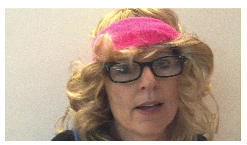
Fig. 5: Williams, Frances (2013) Deirdre's Indecision. [film still]

(This Work is presented in Shift 1: Failure and PD1: Failure.)