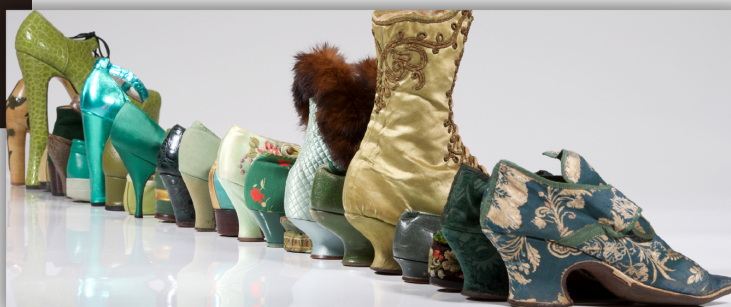
Northampton Museum and Art Gallery

Our Forum gala dinner, at 7pm, will take place at the newly renovated Northampton Museum and Art Gallery , at the heart of our Cultural Quarter, 4-6 Guildhall Rd, Northampton NN1 1DP.