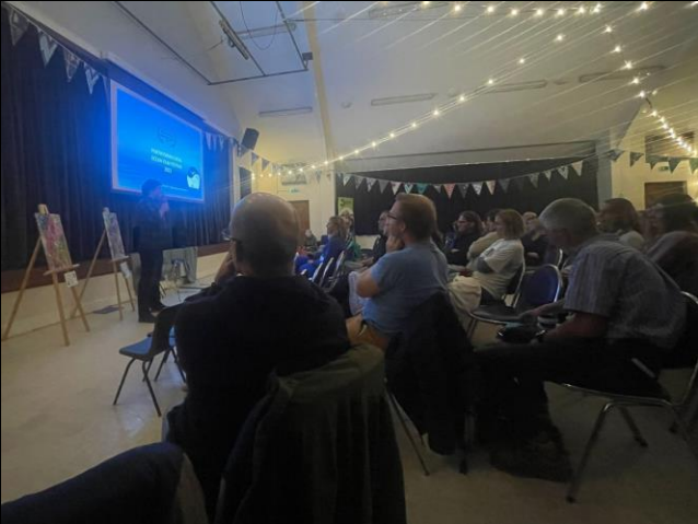
Director's Q&A at the Porthtowan Ocean Film Festival

Promo in the Porthtowan Ocean Film Festival programme