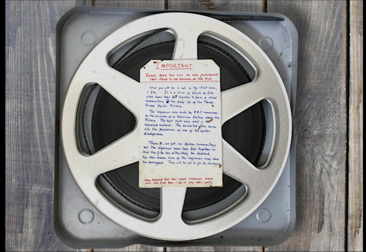
The original can of 16mm film, From the Culch, courtesy Seamonster Media.

https://www.falmouth.ac.uk/research/projects/vernacular-films