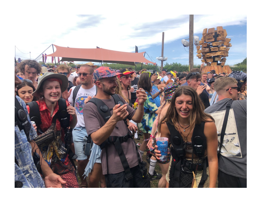
Image: Attendees at Boomtown Fair 2023 Deaf Rave takeover