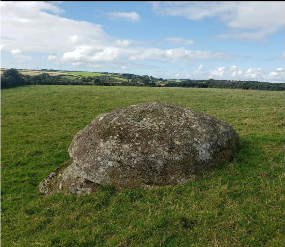
Figure 6: Altar Rock in field near Constantine Quarry.