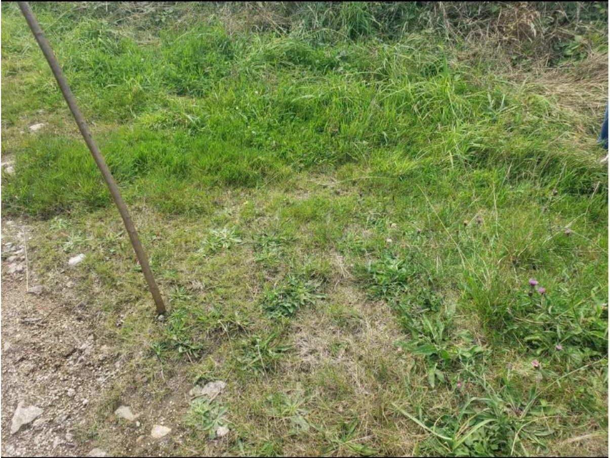
Figure 4: Crossroads of Three Ways near Constantine Quarry.