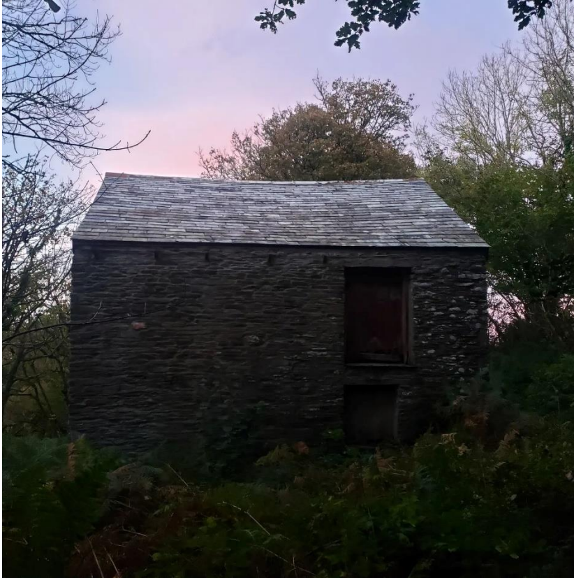
Figure 2: The Barn Behind Minster Church, site of the Boscastle Workings.