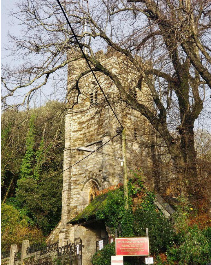
Figure 1: St. Gluvias Church, site of an Invocation of Exu by the early Cultus.