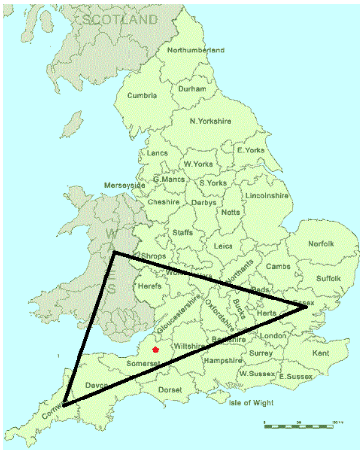
Figure 7: The Three Points of Chumbley’s Pan-British Vision of Witchcraft.

This focus on spirit contact within the British landscape connects all the Cornish sites where Chumbley worked and energizes a larger, overarching vision of a pan-British, tripartite tradition of British witchcraft drawing together the native traditions of Essex, Cornwall, and Wales. Chumbley believed that this tradition could be mapped as a triangle, with Glastonbury as its center as a nexus of numinous power. The rituals performed in conjunction with the sites in this triangle were known as the Cucullati workings, so named because of the mysterious “genii cucullati” or “hooded spirits” found inscribed in stone in multiple sites in the British Isles (Hutton 1991, 216). As scholar of paganism and historian of religions Ronald Hutton explains, the “genii cucullati” are “figures shown standing in full face and wearing the cloak with the pointed hood which gave them their names” (Hutton 1991, 216). Chumbley’s immediate source of information on the genii cucullati may have been the Buckinghamshire coven into which he was first initiated, reinforced by lore from his magical collaborator Michael Howard. Chumbley believed that by evoking these spirits through each site’s native witchcraft traditions, the landscape could be transformed.