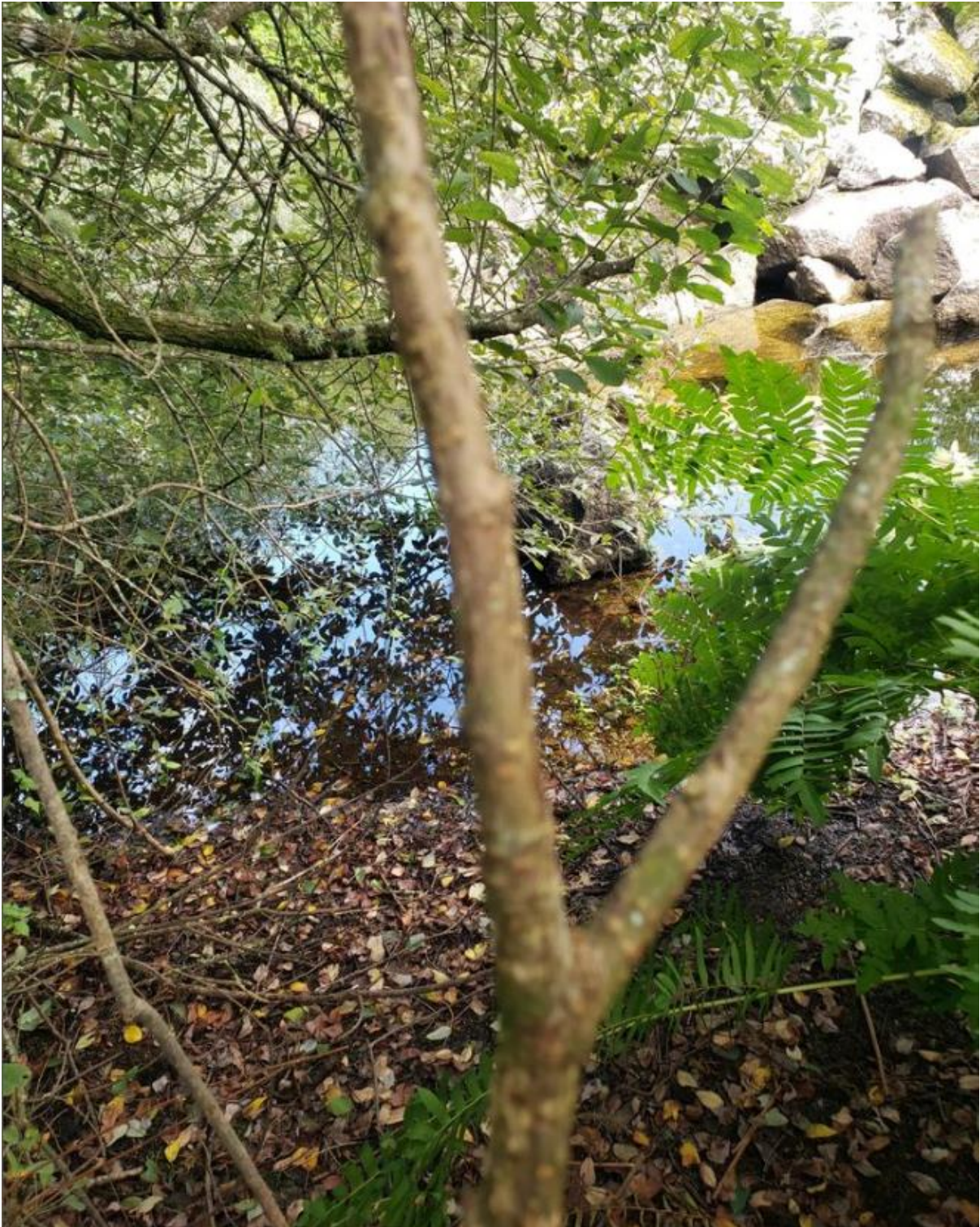
Figure 5: Grove near Constantine Quarry.