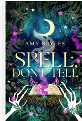
SPELL, DON'T TELL Book 3