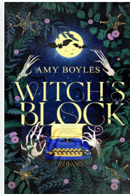
WITCH'S BLOCK Book 1