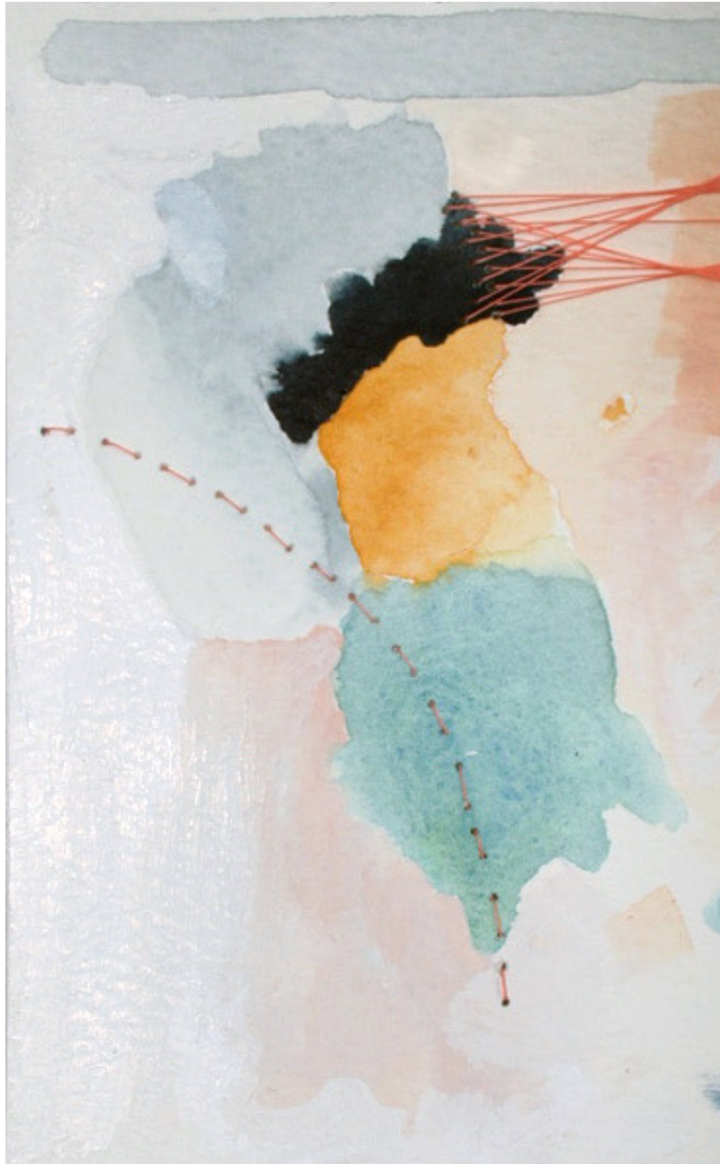
Stain , (2021). Gouache, watercolour, acrylic and cotton thread on paper.