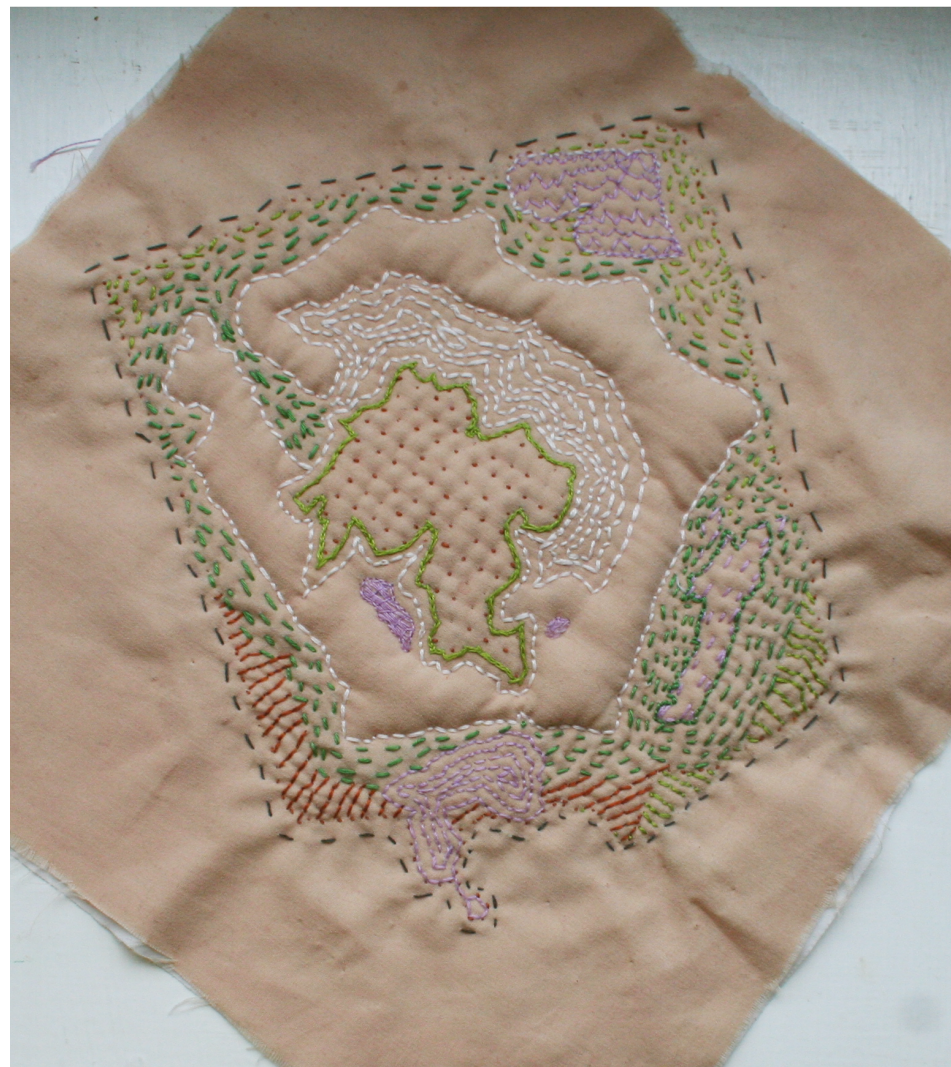
Mapping Rebellion , (2020). Cotton and silk needlepoint, wadding, avocado pigment, on post-consumer cotton.